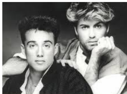
Wham! Were a band in the 80's. Andrew Ridgeley and George Michael.

A --5--5--5--5--3--3--3--3--|--2--2--2--0--0--2--2--|-- E -----|-----| C -----|-----| G -----|-----|